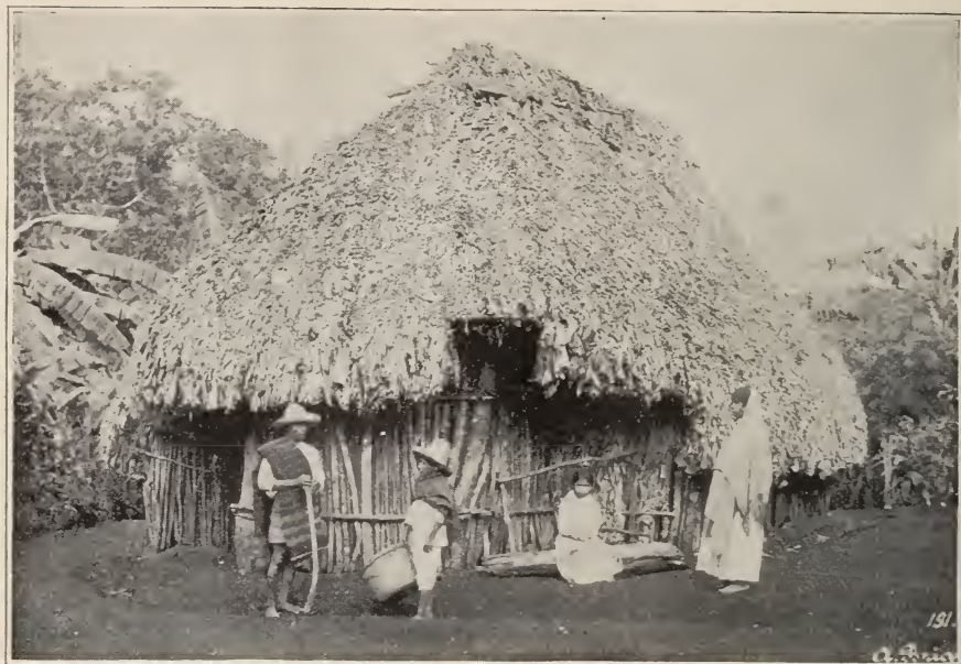
NATIVE HUT NEAR CORDOVA, VERA-CRUZ, MEXICO.